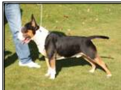
Conreniam Dark Magician. "This dog is right up there with the likes of Lord of The Timar and his Litter Brother Legendary Leon of The Timar."

"Since GCP is a dietary supplement, it is harmless to patients," he adds. "Plus it's inexpensive and easy to administer in a pill form. There's really no downside here."